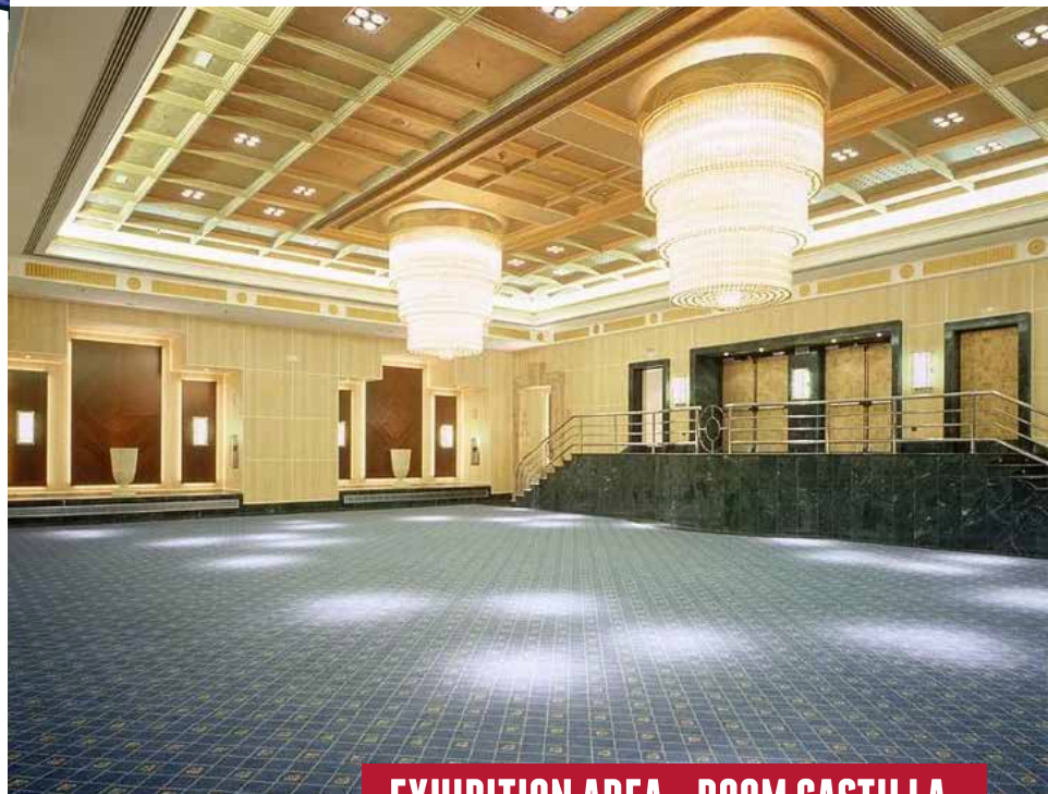
EXHIBITION AREA - ROOM CASTILLA