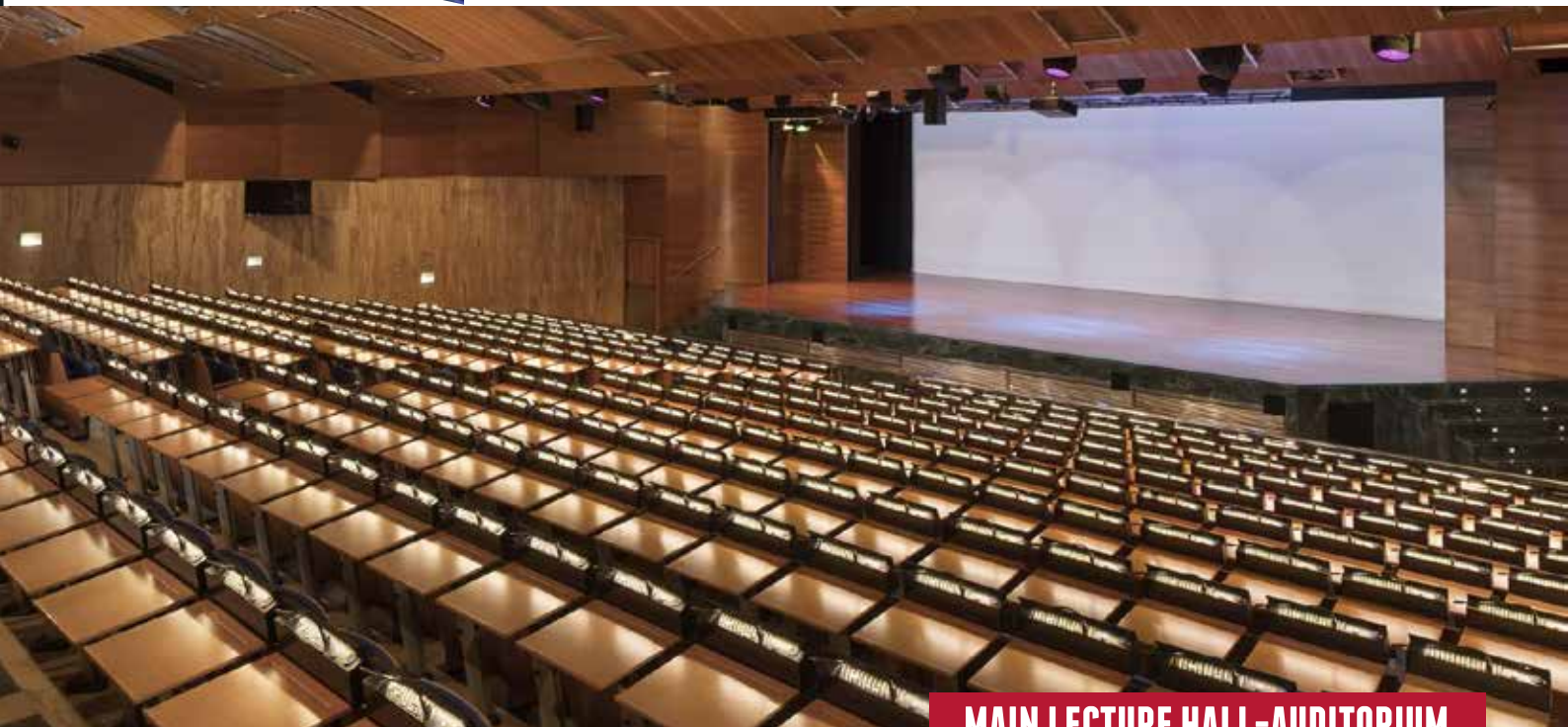
MAIN LECTURE HALL-AUDITORIUM